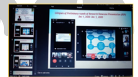
Dec. 2020 (online)