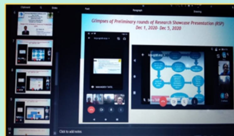
Dec. 2020 (Online)